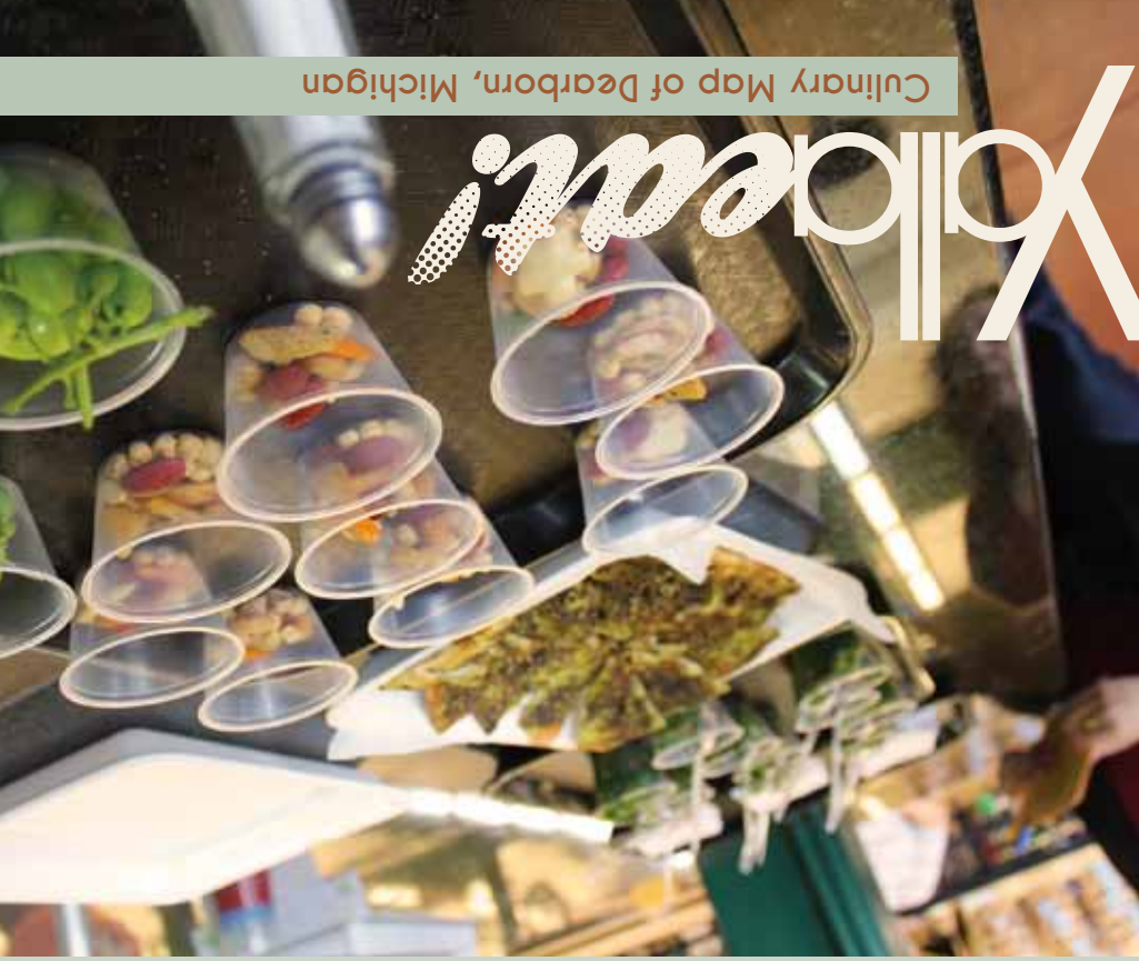
Culinary Map of Dearborn, Michigan